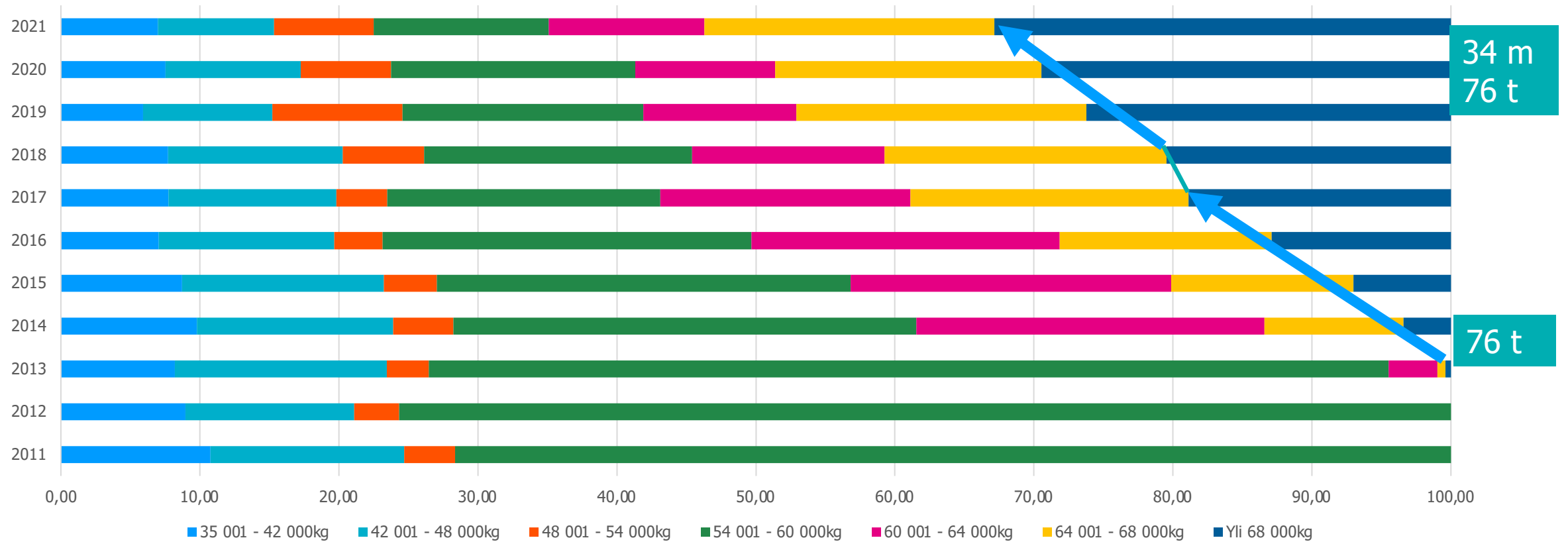
Domestic traffic share in weight categories